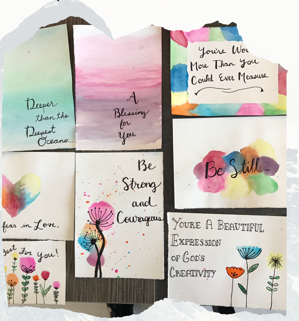
Cards I made while doing a day of ministry in a red-light district in Southern France.

During the three months of my Justice school in France I met with, and ministered to, trafficking victims from all over the world that were working in the red-light districts there. Many are from Ethiopia, where dark voodoo curses have them in bondages of fear, preventing them from leaving their traffickers. Many others are Russian, Romanian and other Eastern European women that were young and desperately poor when they were first preyed upon. Regardless of the background of the women and men I meet, they all struggle with knowing their worth and their identity in Christ. Now, the Lord is calling me back for a two year, voluntary commitment to bring this same Truth we have been committed to sharing at VBB—that Jesus died for my sins, and your sins, just as much as He did for theirs. I continue to see traffickers, trafficking victims, clients, and others involved, brought to their knees as we share this hope!